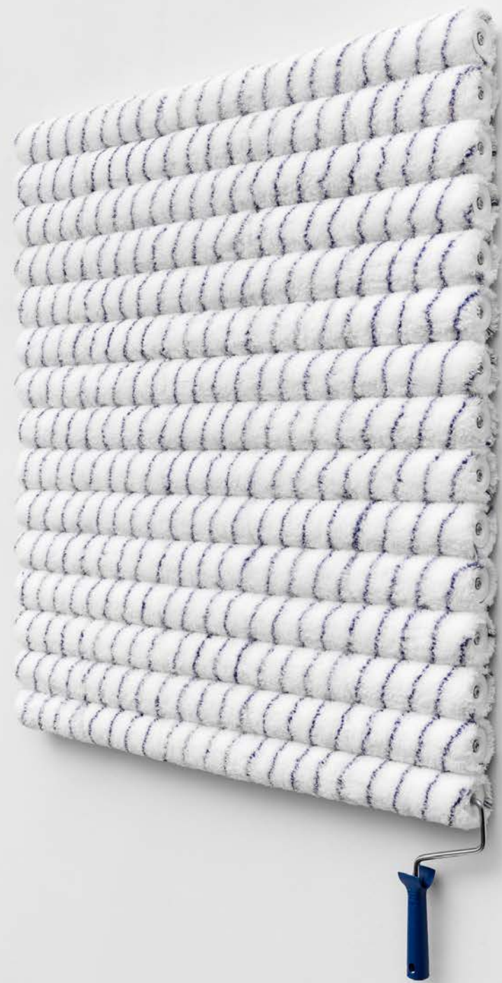
Elmgreen & Dragset, Home Painting , 2023 (additional image)