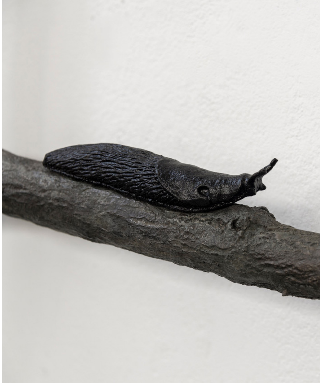
Elmgreen & Dragset, The Journey , Fig. 1, 2022 (detail)