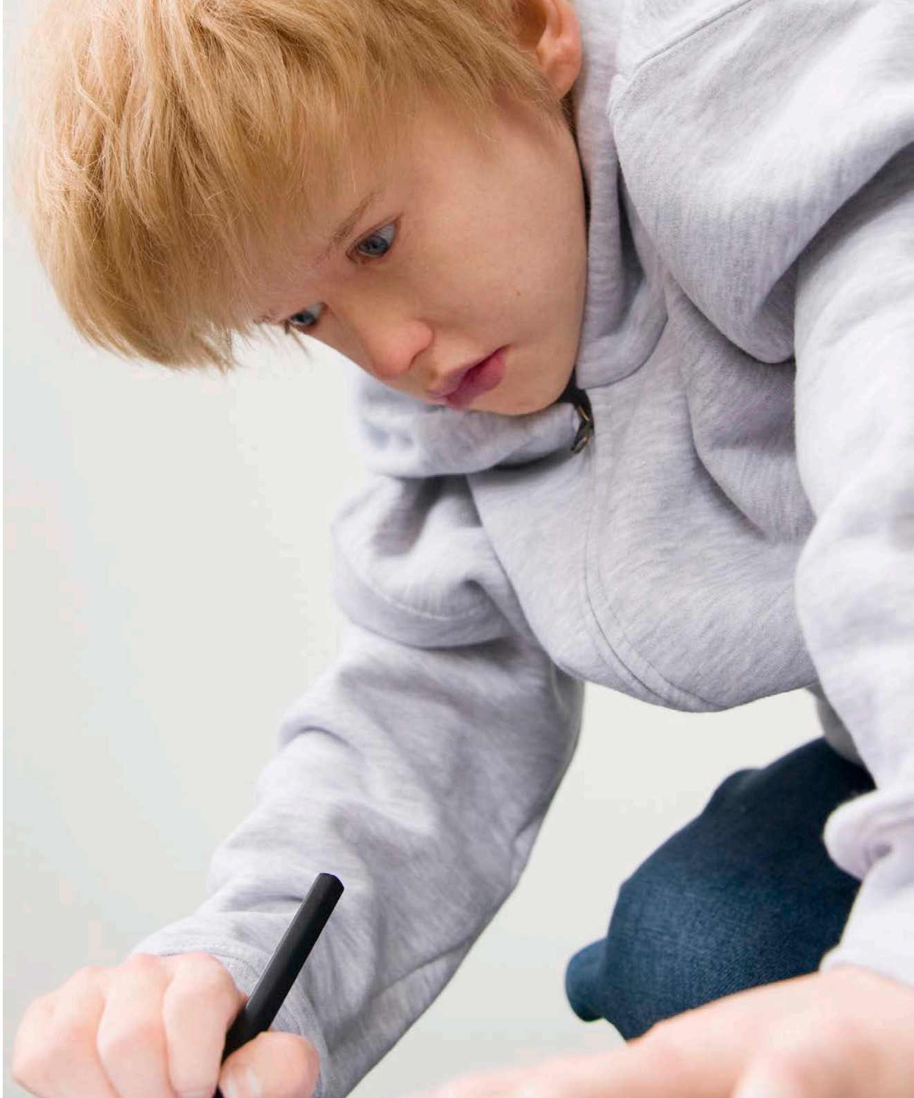
Elmgreen & Dragset, The Drawing , 2023 (detail)