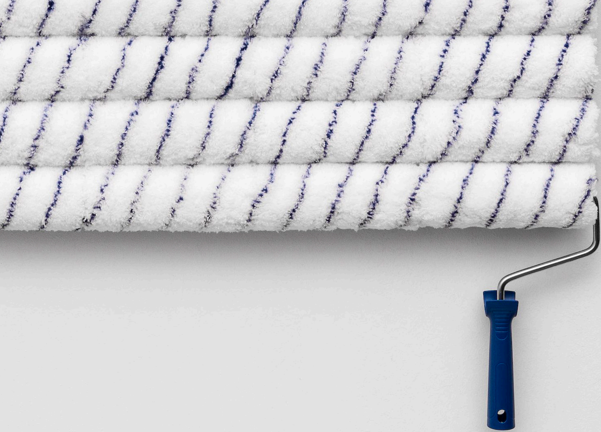
Elmgreen & Dragset, Home Painting , 2023 (detail)