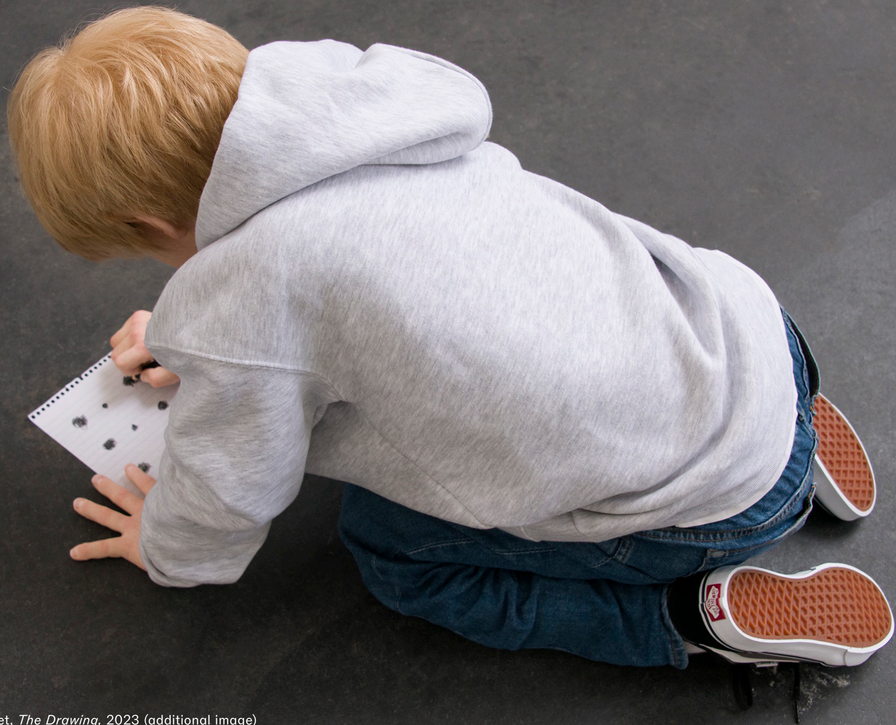
Elmgreen & Dragset, The Drawing , 2023 (additional image)